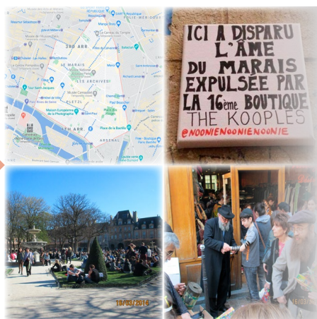
Le Marais, Paris